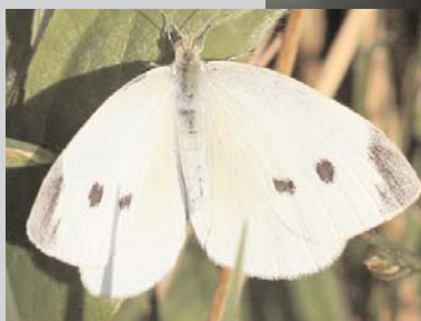
large cabbage white butterfly

Two different species of cabbage white butterfly exist, the large cabbage white ( Pieris brassicae ) and the small cabbage white ( Pieris rapae ). They overwinter as pupae with adult butterflies emerging to mate in spring. Male butterflies have a single dark spot on their mid-wing while females have two spots.