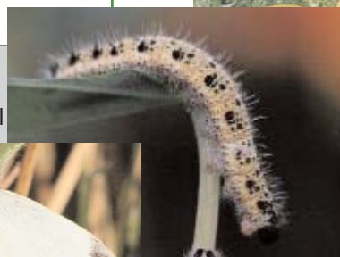
caterpillar of large cabbage white