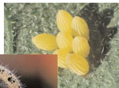
eggs of large cabbage white