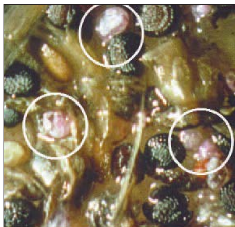
Figure 2. Carbofuran granules (circled) can be seen alongside weed seeds and other plant material retrieved from a poisoned duck