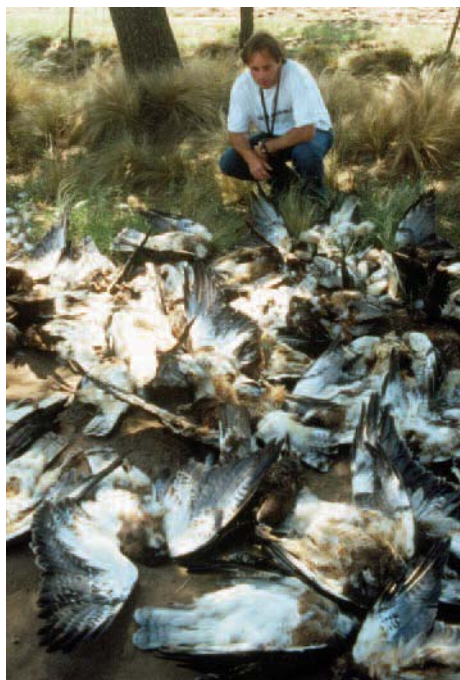
Figure 4. What people imagine a bird kill should look like. Swainson's hawks killed by monocrotophos were gathered from surrounding fields for the photograph