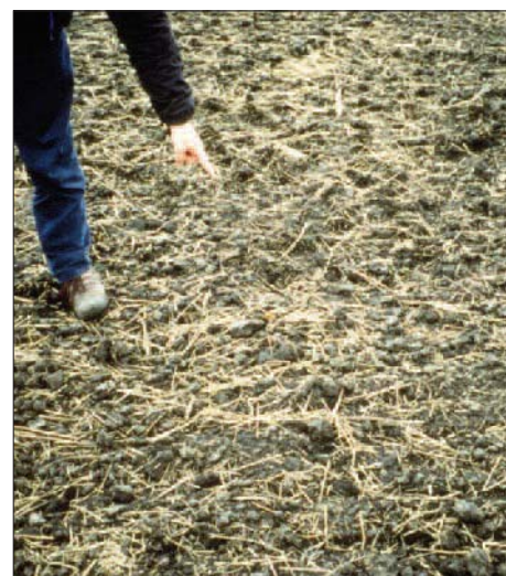
Figure 1. The observer is pointing to a dead bird in freshly sown oilseed rape – not the easiest to see but typical of most bird kills

Some of the methods of pesticide delivery