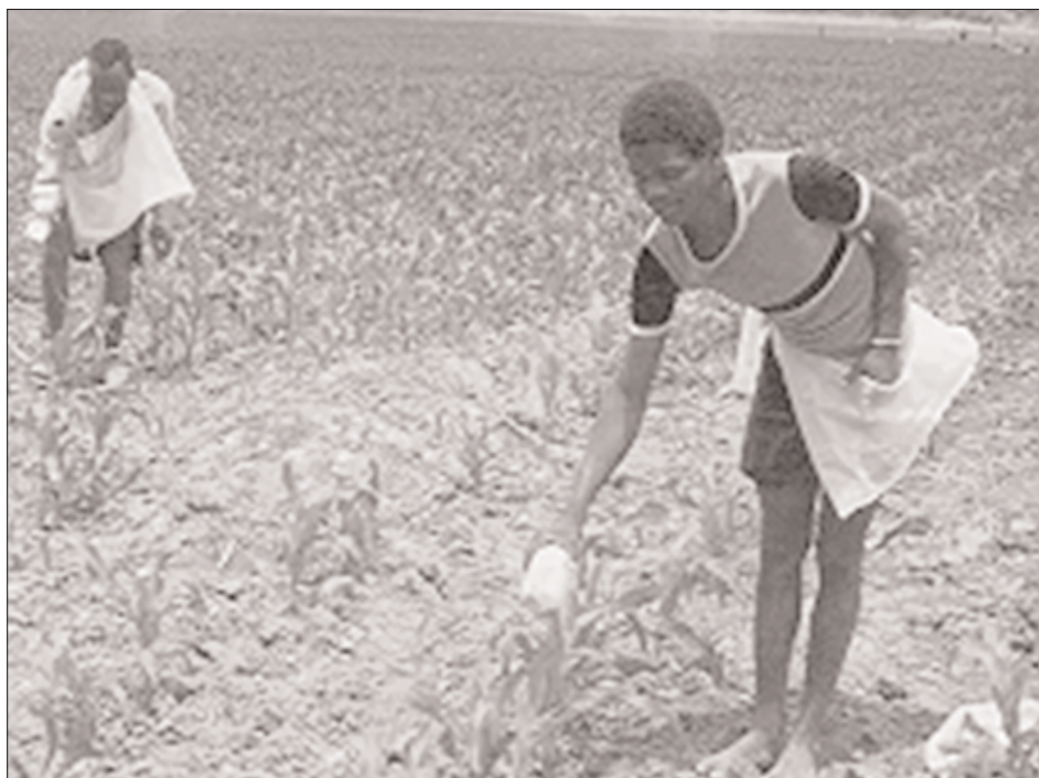
Figure 3. Agricultural workers sprinkling insecticide granules on maize plants

Although the kills came as a shock to the conservation community, the carnage was surely no surprise to the manufacturers. As early as 1970, the two leading manufacturers of monocrotophos 17 had conducted small-scale tests in Europe in response to reported bird mortality. These unpublished tests had uncovered 74 dead or paralysed birds in only two hectares of crop, an amazing bird density by today's standard 18 . The following year, two Colorado researchers carried out a one-time search and found 69 dead or debilitated individuals, including birds of prey in a 32 ha wheat field treated with monocrotophos 19 . Kill reports were coming from many parts of the globe in a wide variety of croplands. Before the aforementioned incident in Argentina, the largest kill on record had been an estimated 10,000 wintering American robins ( Turdus