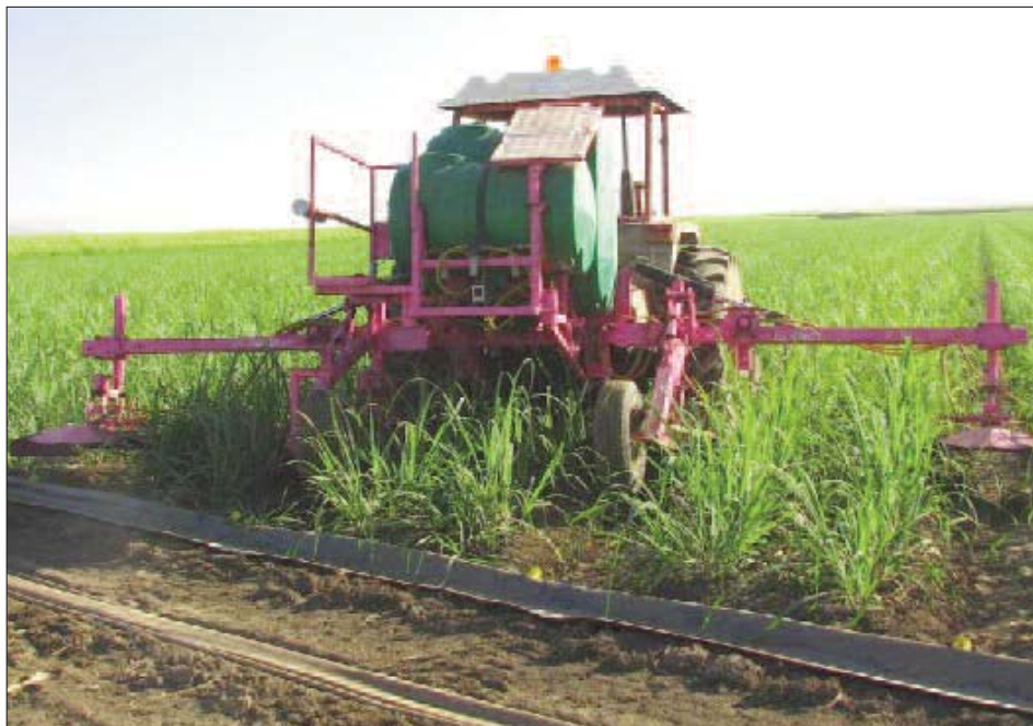
The control of weeds using shielded sprayers is being encouraged as an improved management practice in the sugar industry. This approach targets weeds early, reduces the total amount of herbicide applied, uses products less susceptible to runoff (such as glyphosate), and reduces the need for residual herbicide control.