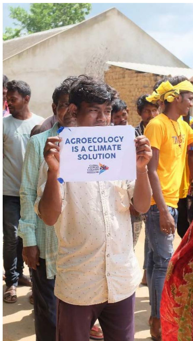
Kheria Sabar indigenous peoples join the Global People's Caravan in West Bengal, India.