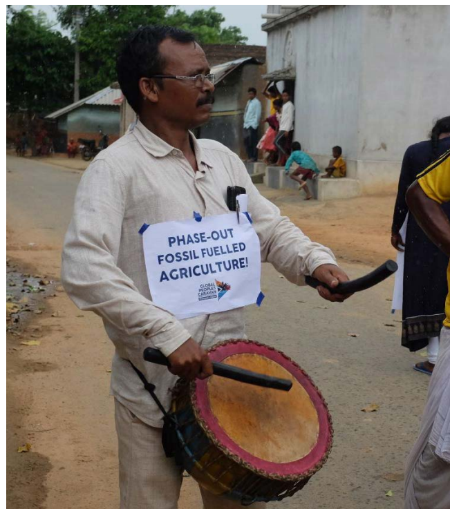
Kheria Sabar indigenous peoples join the Global People's Caravan in West Bengal, India.

Agroecology is also recognised as a key food transformation approach by the UN Food and Agriculture Organization (FAO) and its members. The FAO’s Scaling up Agroecology Initiative aims to catalyse cooperation on agroecology within the UN System and by supporting national agroecology policy and technical capacity and building synergies between countries. 31